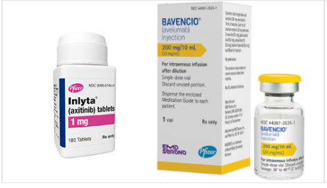
Bavencio Plus Inlyta Approved as First-Line Tx for Advanced Renal Cell Carcinoma